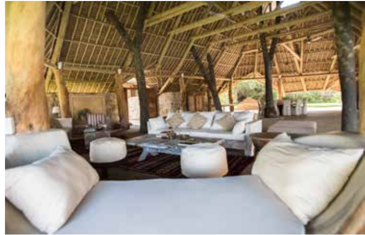
Sheldrick Wildlife Trust Eco-lodges supporting Kenya's diverse wildlife and wild places through sustainable tourism;