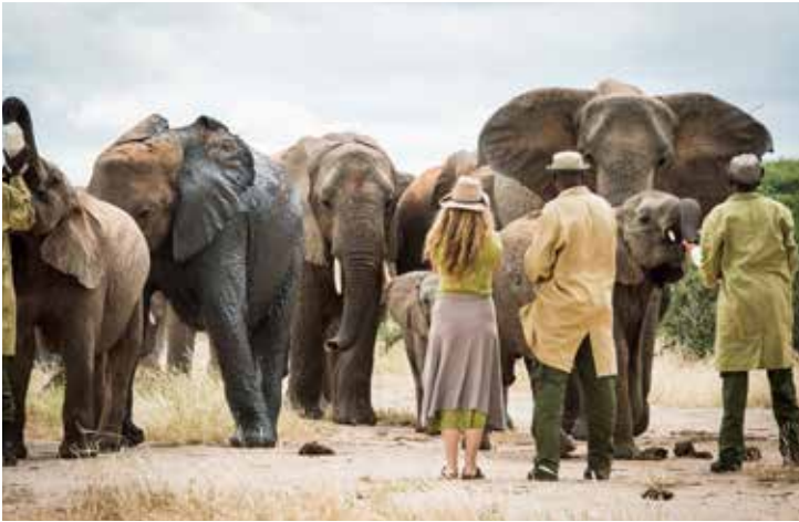
Umani Springs ~ Ithumba Camp ~ Ithumba Hill ~ Ithumba Private ~ Galdessa Camp ~ Galdessa Little